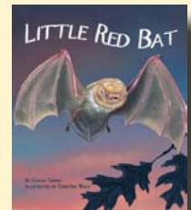
LITTLE RED BAT

Baby Bat and Pluribus Packrat explore their cave and meet animals without eyes or colors. Baby Bat learns how important bats are to the cave habitat.