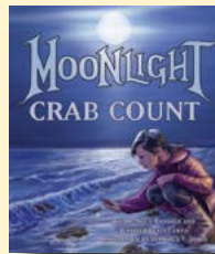
MOONLIGHT CRAB COUNT

Leena, and her mom, hop in the boat for a night of citizen science counting horseshoe crabs. Learn valuable facts as they survey these ancient animals.