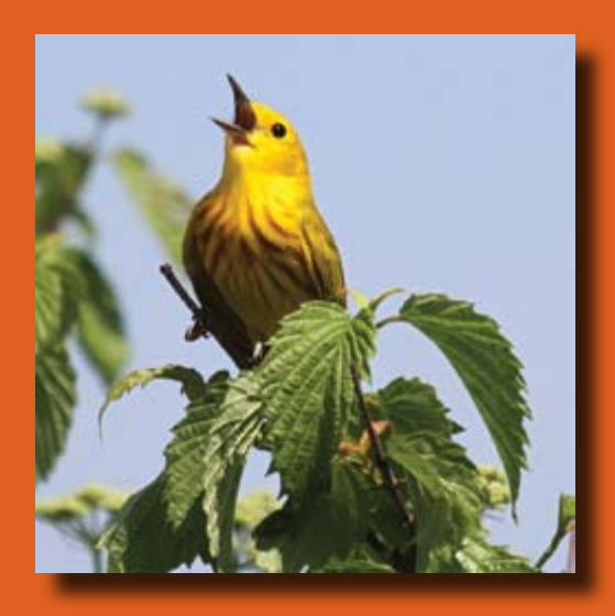
Praise for the Animal Anatomy and Adaptations Series

"I feel so very lucky, as each day I get to discover something new. I never know what I'm going to find. I head outdoors, and go on what is to me very much like an Easter egg hunt – I look for animals and their signs and rarely do I come home without having found something new to observe and admire."