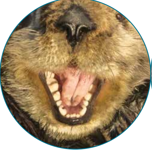
2: flat molars to break shells