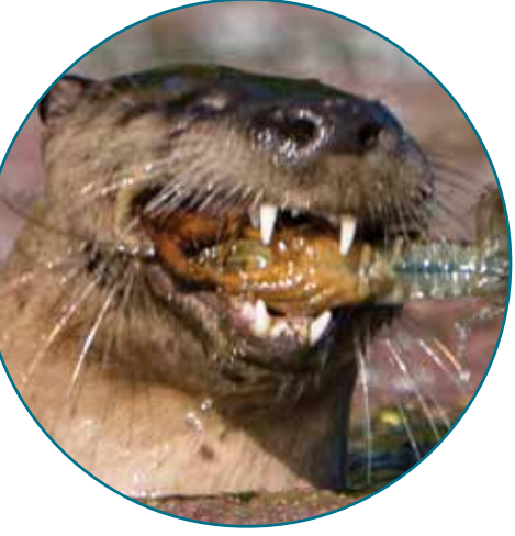
3: sharp teeth to hold prey