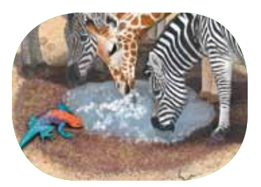
C. Animals need water to live. Elephants dig into dry earth to find water underneath.