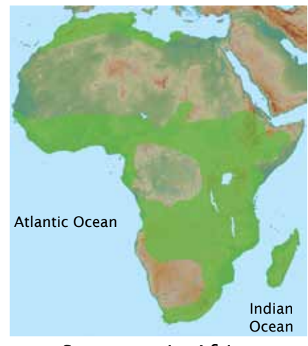
Savannas in Africa

All the living things in an ecosystem are connected. Sometimes there is one species that plays an important role in the ecosystem. This is called a keystone species . A keystone species helps other living things meet their basic needs. If something happens to a keystone species, the whole ecosystem is hurt. In the African savanna, elephants are a keystone species.