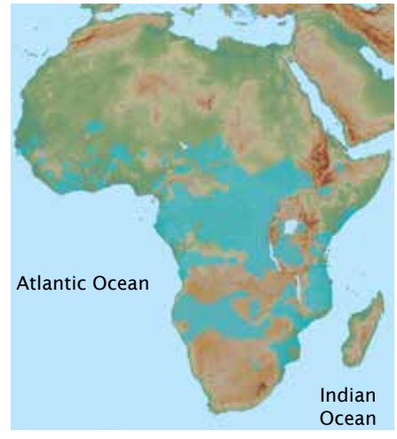
Elephant habitats in Africa

Elephants used to live across all of Africa south of the Sahara desert. Now the places where they can live (habitats) are shrinking. People build new cities and roads, use savannas for farmland, and cut down forests. There are fewer wild places for elephants to live. This is called habitat loss.