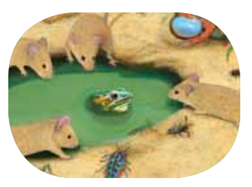
D. Rain gathers in the elephants' footprints. Animals drink out of the small puddles.

Rainy season: A and D. Dry season: B and C.