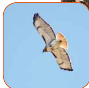
5 red-tailed hawk

A My tail helps me fly. My short, wide tail feathers catch the wind and let me steer as I soar through the sky.