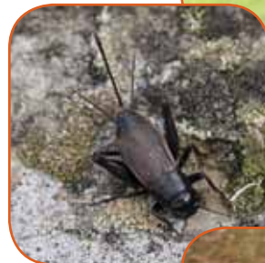
3 field cricket