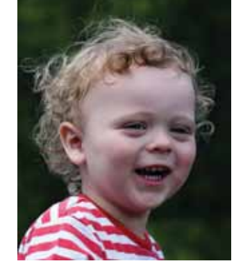
To Otis, who is such a good listener!—MH